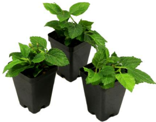
SHIPPED IN 2.5-INCH POTS. PLANT SIZE MAY VARY BASED ON GROWING CONDITIONS.

Note: Some leaves may appear wilted or yellow upon arrival. This is due to the stress of shipping and is nothing to worry about. Water the plant and let it recover in a shady location for a few days, then gently remove any foliage that does not recover to allow for new growth.