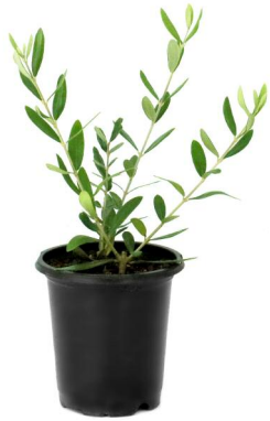
SHIPPED IN A 6-INCH POT. PLANT SIZE MAY VARY BASED ON GROWING CONDITIONS.

Note: Some leaves may appear wilted or yellow upon arrival. This is due to the stress of shipping and is nothing to worry about. Water the plant and let it recover in a shady location for a few days, then gently remove any foliage that does not recover to allow for new growth.