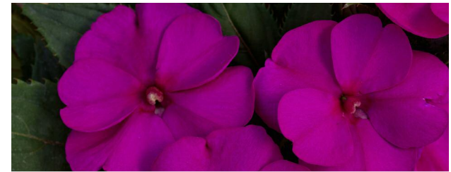
Flowering Patio Combo