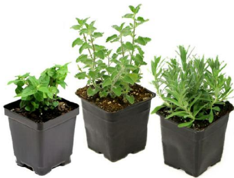
SHIPPED IN 3.25-INCH POTS. PLANT SIZE MAY VARY BASED ON GROWING CONDITIONS.

Note: Some leaves may appear wilted or yellow upon arrival. This is due to the stress of shipping and is nothing to worry about. Water the plant and let it recover in a shady location for a few days, then gently remove any foliage that does not recover to allow for new growth.