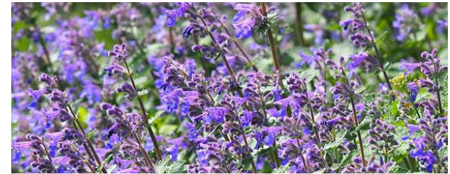
Bugs Away Garden