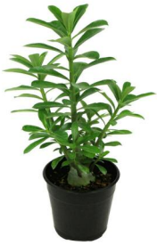
SHIPPED IN A 6-INCH POT. PLANT SIZE MAY VARY BASED ON GROWING CONDITIONS.

Note: Some leaves may appear wilted or yellow upon arrival. This is due to the stress of shipping and is nothing to worry about. Water the plant and let it recover in a shady location for a few days, then gently remove any foliage that does not recover to allow for new growth.