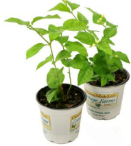
SHIPPED IN 4-INCH POTS. PLANT SIZE MAY VARY BASED ON GROWING CONDITIONS.

Note: Some leaves may appear wilted or yellow upon arrival. This is due to the stress of shipping and is nothing to worry about. Water the plant and let it recover in a shady location for a few days, then gently remove any foliage that does not recover to allow for new growth.