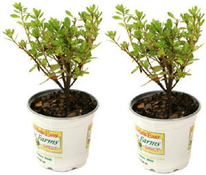
SHIPPED IN 4-INCH POTS. PLANT SIZE MAY VARY BASED ON GROWING CONDITIONS.

Note: Some leaves may appear wilted or yellow upon arrival. This is due to the stress of shipping and is nothing to worry about. Water the plant and let it recover in a shady location for a few days, then gently remove any foliage that does not recover to allow for new growth.