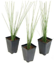
SHIPPED IN 2.5-INCH POTS. PLANT SIZE MAY VARY BASED ON GROWING CONDITIONS.

Note: Some leaves may appear wilted or yellow upon arrival. This is due to the stress of shipping and is nothing to worry about. Water the plant and let it recover in a shady location for a few days, then gently remove any foliage that does not recover to allow for new growth.