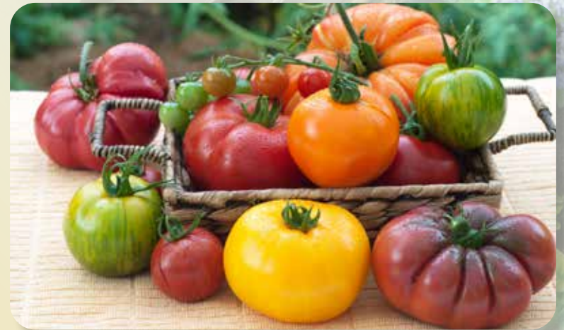
3pc Heirloom Tomatoes Solanum lycopersicum 'Heirloom'