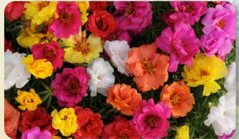
3pc Sundial™ Portulaca Portulaca hybrids