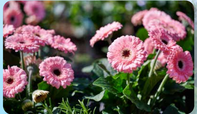
3pc Sweet Pastry Hardy Gerber Daisy Plants Gerbera hybrids 'Sweet Pastry'

We aren't happy if you aren't happy. If you have any questions regarding your order please call us at 1-765-525-4065 during the hours of 8:30 am and 4:30 pm EST.