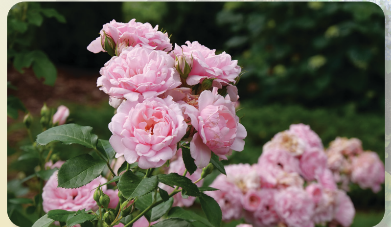
Parfuma® Summer Romance Shrub Rose Rosa hybrid 'Parfuma'