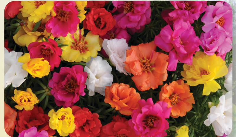
Happy Hour™ Portulaca Portulaca hybrids