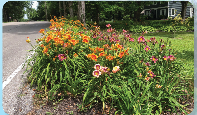
Island Series Daylily Collection Hemerocallis hybrids 'Island Series'

We aren't happy if you aren't happy. If you have any questions regarding your order please call us at 1-765-525-4065 during the hours of 8:30 am and 4:30 pm EST.