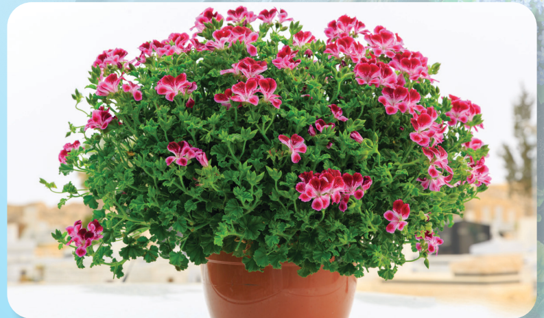
Mosquitaway® Citronella Geranium Pelargonium citrosum

We aren't happy if you aren't happy. If you have any questions regarding your order please call us at 1-765-525-4065 during the hours of 8:30 am and 4:30 pm EST.