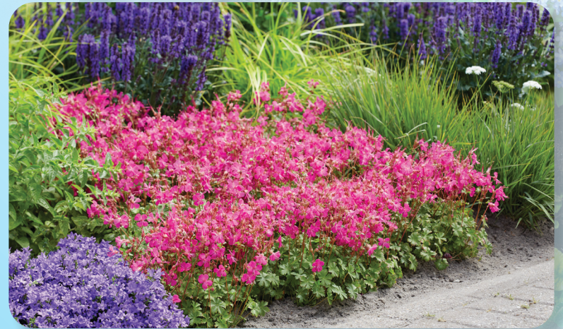
Hardy Geranium Geranium hybrids

We aren't happy if you aren't happy. If you have any questions regarding your order please call us at 1-765-525-4065 during the hours of 8:30 am and 4:30 pm EST.