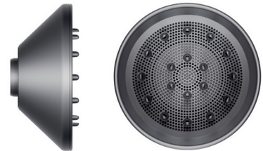
Diffuser Helps to define curls