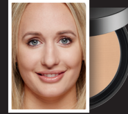
09 LIGHT NATURAL Light to medium skin with neutral tones