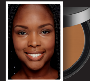
26 CHAI Dark skin with golden tones