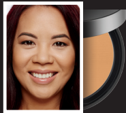
17 CAMEL Medium to tan skin with rich golden tones