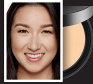
03 CHAMPAGNE Fair skin with golden tones