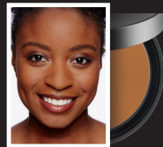
25 HAZELNUT Dark skin with neutral tones