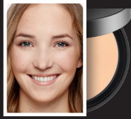
02 DAWN Fair skin with neutral tones