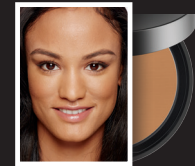
21 SABLE Tan skin with neutral tones