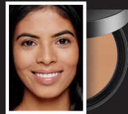
18 PECAN Tan skin with cool tones