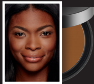
29 TRUFFLE Deep skin with neutral tones