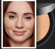
06 CASHMERE Light skin with cool to neutral tones