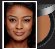
24 NUTMEG Dark skin with cool to neutral tones