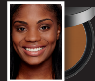
27 CAPPUCCINO Dark skin with rich golden tones