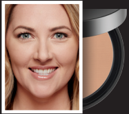
10 COOL BEIGE Medium skin with cool tones