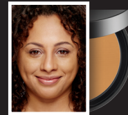
20 HONEYCOMB Tan skin with golden tones