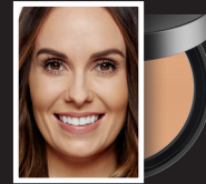
14 SILK Medium to tan skin with cool to neutral tones