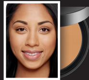
19 TOFFEE Tan skin with neutral tones