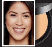
08 GOLDEN IVORY Light skin with golden tones