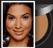
23 CARDAMOM Tan to dark skin with golden tones