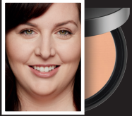
05 SATEEN Light skin with cool tones