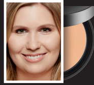
04 ASPEN Fair to light skin with neutral tones