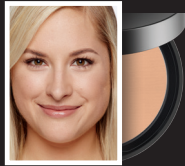
11 NATURAL Medium skin with cool to neutral tones