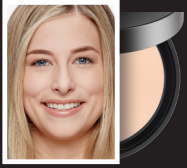
01 FAIR Fair skin with cool tones