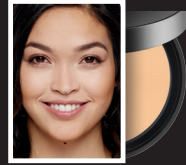
07 WARM LIGHT Light skin with neutral to golden tones