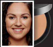
16 SANDSTONE Medium to tan skin with neutral tones