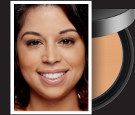
15 SANDALWOOD Medium to tan skin with golden tones