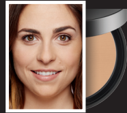
12 WARM NATURAL Medium skin with neutral to golden tones