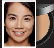
13 GOLDEN NUDE Medium skin with golden tones