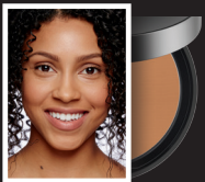
22 TEAK Tan to dark skin with neutral to golden tones