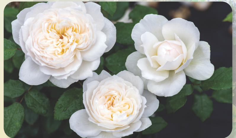
Scentables™ Rose (choice of) Rosa hybrids