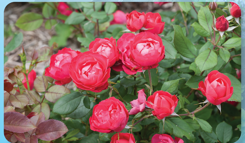
Proven Winners® OSO Easy® Rose Rosa hybrida