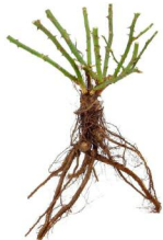
SHIPPED AS A BARE ROOT PLANT.

Note: The roots of your bare root rose are coated with Terra-Sorb® Hydrogel to protect them from drying out during handling and transport. It is suitable for planting and should be left on the roots at planting time.