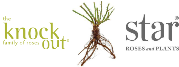
SHIPPED IN BARE ROOT FORM.

Note: The roots of your bare root plant are coated with Terra-Sorb® Hydrogel to protect them from drying out during handling and transport. It is suitable for planting and should be left on the roots at planting time.