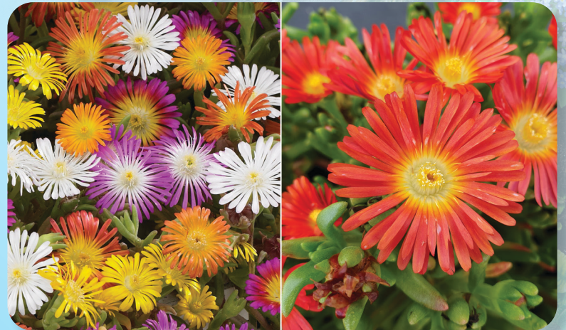
WOW® Series Ice Plant Delosperma cooperi hybrids

We aren't happy if you aren't happy. If you have any questions regarding your order please call us at 1-765-525-4065 during the hours of 8:30 am and 4:30 pm EST. You can email questions to us at: customerservice@robertasinc.com .