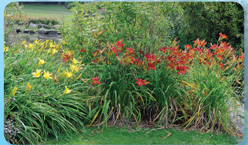
ReBlooming Daylily Collection Hemerocallis hybrids