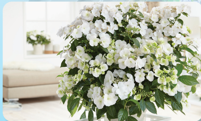
Proven Winners® Fairytrail Bride® Cascade Hydrangea Hydrangea x

We aren't happy if you aren't happy. If you have any questions regarding your order please call us at 1-765-525-4065 during the hours of 8:30 am and 4:30 pm EST.