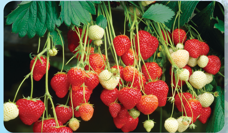
Ozark Beauty Strawberries Fragaria ananassa hybrids

We aren't happy if you aren't happy. If you have any questions regarding your order please call us at 1-765-525-4065 during the hours of 8:30 am and 4:30 pm EST. You can email questions to us at: customerservice@robertasinc.com .