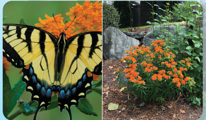
Native Asclepias Butterfly Bouquet Plants Asclepias spp.

We aren't happy if you aren't happy. If you have any questions regarding your order please call us at 1-765-525-4065 during the hours of 8:30 am and 4:30 pm EST. You can email questions to us at: customerservice@robertasinc.com .