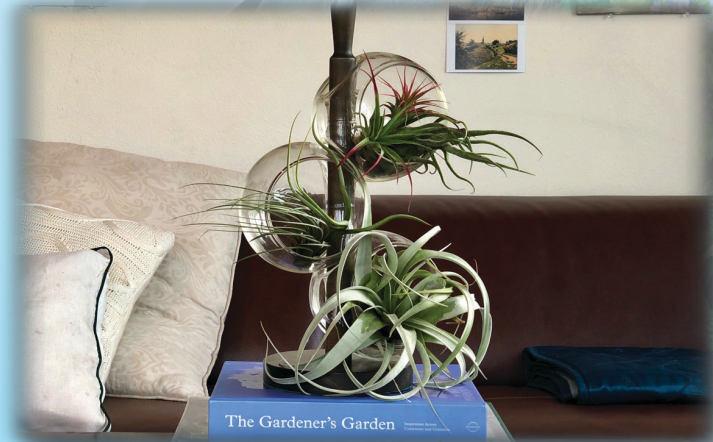
Air Plant Collection Tillandsia spp.

We aren't happy if you aren't happy. If you have any questions regarding your order please call us at 1-800-428-9726 during the hours of 8:30 am and 4:30 pm EST.