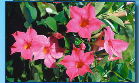
Mandevilla (Mandevilla sanderi hybrids)