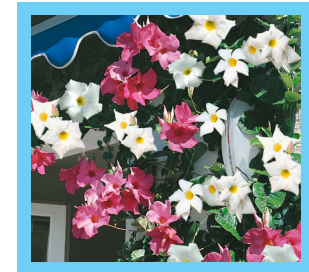
Elegantly gracing an awning