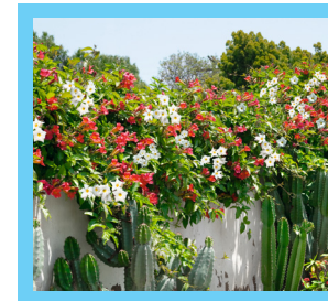
Red and White flourishing along a wall