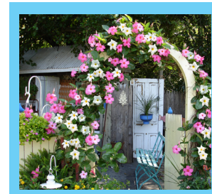
Pink and White blooming along an archway