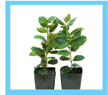
Mandevilla Shipped as Shown