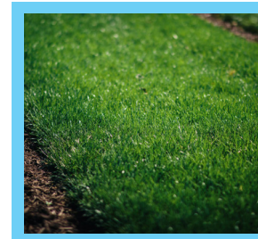
Performs best when kept at 1 to 1.5" tall