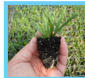
Discovery spreads and establishes very quickly in the garden