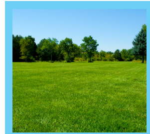
Rapid lateral growth for full coverage