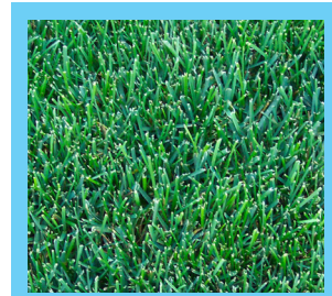
Thick and dense growth pattern