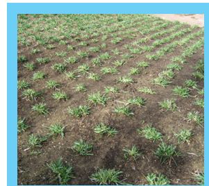
Newly planted rhizomes