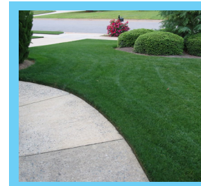
Lush, dark alpine green