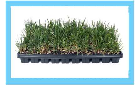
Discovery Bermuda Grass Shipped as Shown