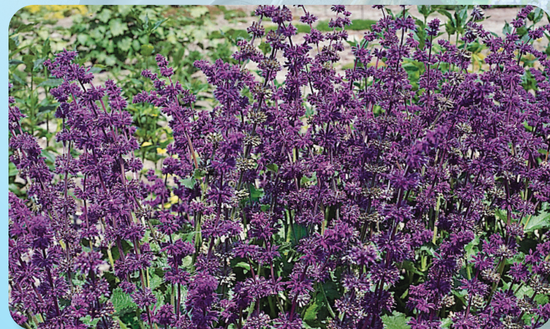
Salvia Collection Salvia

We aren't happy if you aren't happy. If you have any questions regarding your order please call us at 1-765-525-4065 during the hours of 8:30 am and 4:30 pm EST.