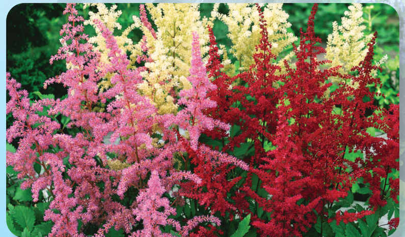
Astilbe or False Spirea Astilbe

We aren't happy if you aren't happy. If you have any questions regarding your order please call us at 1-765-525-4065 during the hours of 8:30 am and 4:30 pm EST.