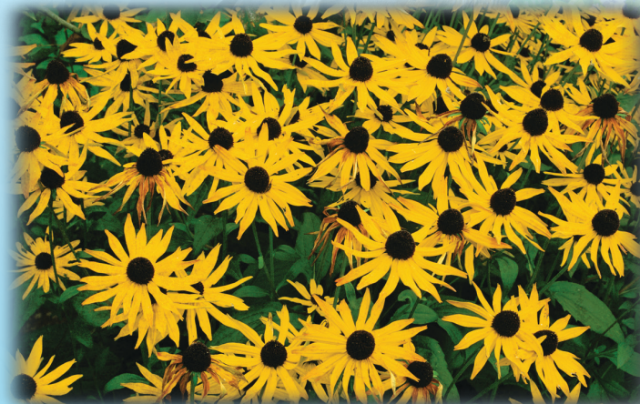
Black-eyed Susan Rudbeckia goldsturm

We aren't happy if you aren't happy. If you have any questions regarding your order please call us at 1-800-428-9726 during the hours of 8:30 am and 4:30 pm EST.