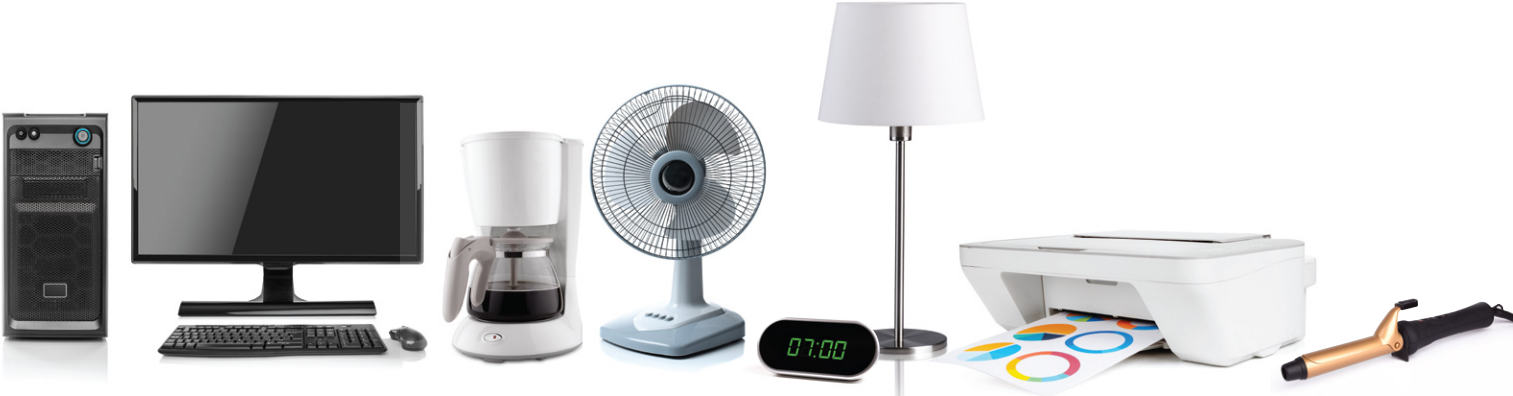
Desktop Computers, Coffee Makers, Fans, Alarm Clocks, Lamps, Inkjet Printers, Styling Tools, and more.