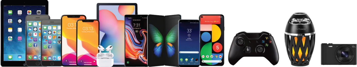
Phones, Tablets, Game Controllers, Cameras, Speakers, Electric Toothbrushes, and more.