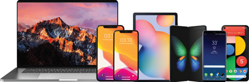
New Phones and Tablets, Select Laptops, Speakers, and more.