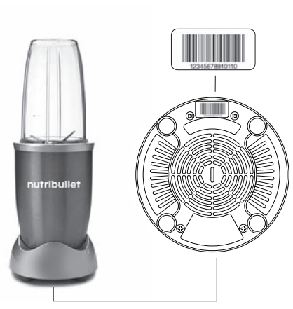
How to find serial number under the motor base.

The registration will enable us to contact you in the unlikely event of product safety notification. By registering your product you acknowledge to have read and understood the instructions for use, and warnings set forth in the accompanying instructions.