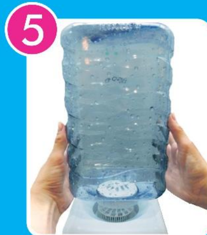
5. Turn bottle upside down into unit. Wait 1 hour before using your Little Luxury water cooler