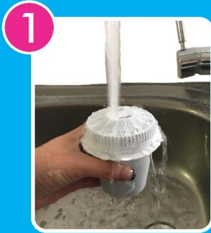
1. Rinse filter under a running tap gently shaking for 60 seconds.

Tip - Vitality Filter - on first use flush filter under running water to clear out loose carbon