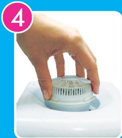
4. Fit the filter cartridge into the unit