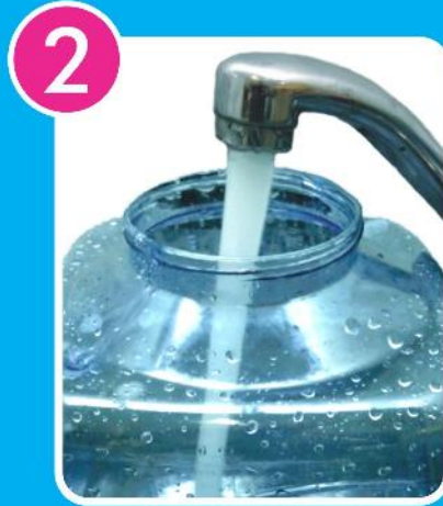
2. Fill bottle with cold tap water