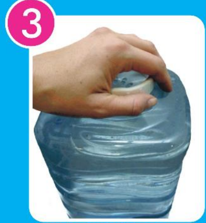
3. Close the bottle screw cap tightly