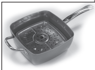
Steamer Tray in Pan