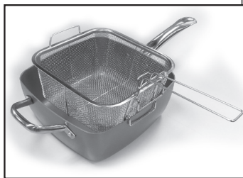
Fry Basket can hook on edge of pan to drain off excess oil.