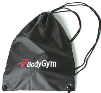
BodyGym Travel Bag

60 Gym Quality exercises that sculpt your abs, arms, shoulders, legs and butt.