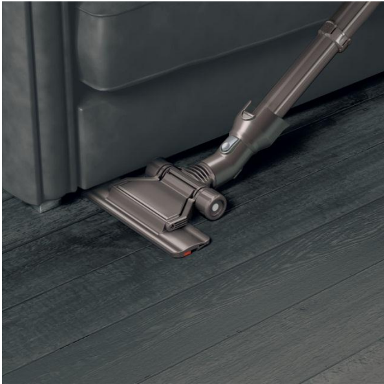
Flat Out™ Tool

Articulates for effective pick-up, and is especially handy for cleaning under low furniture and household appliances.