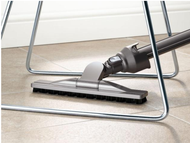
Articulating Hard Floor Tool

Designed for improved pickup on hard floors, with bristles that help to prevent scratching or marking on wood or delicate floors. It pivots 180° and has an ultra-slim profile to clean hard to reach spaces more easily.