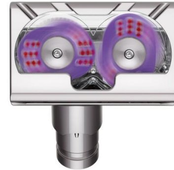
Tangle-free Turbine Tool

Counter-rotating heads with brushes to remove hair and dirt from carpets and upholstery. When tested against 18 competitor vacuums, it's the only turbine tool that doesn't tangle.