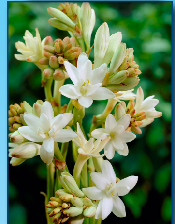
Double Pearl Tuberoses ( Polianthes tuberosa hybrids)