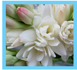
Double Flowered Tuberose close-up