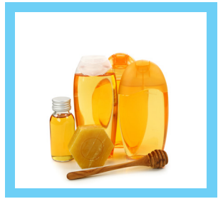
Valuable Essential Oil