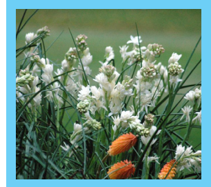
Tuberose in Bloom late August