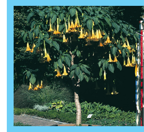
Full Grown Plant in Container