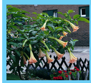
Full Grown Plant in Warm Winter Climate