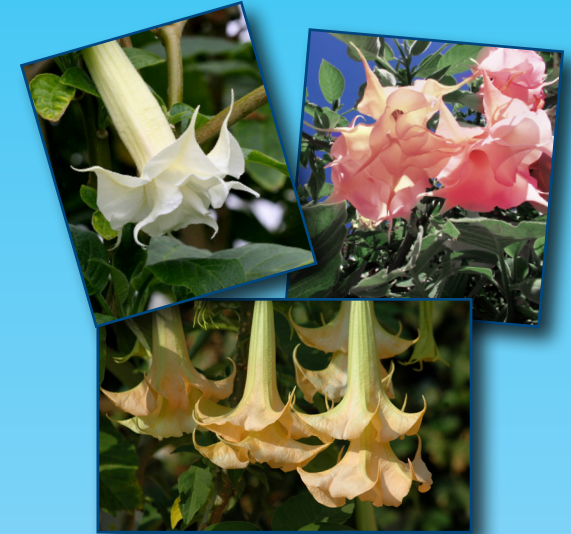
Large Bloom Angel Trumpet Patio Tree (Brugmansia Hybrids)