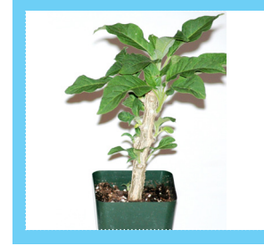
Angel's Trumpet Shipped As Shown