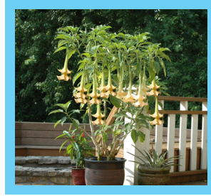
Established 1 to 2 year Old Plant