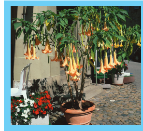
Versicolor Apricot 1 to 2 years old