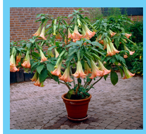
Insignis Pink 1 to 2 years old

CAUTION: Not all plant material is edible. Though most plants are harmless, some contain toxic substances which can cause headaches, nausea, dizziness, or other discomforts. As a general rule, only known food products should be eaten. In case of ingestion on any other plant or flower, please contact your local poison center at once and advise them of the plant ingested. Keep out of reach of children and pets.