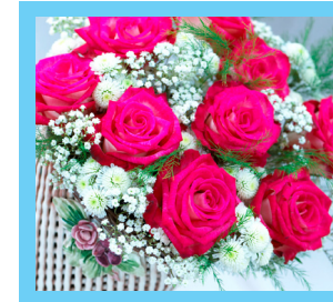
Baby's Breath and Roses