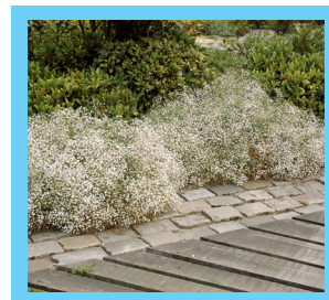
In the garden heat and drought tolerant