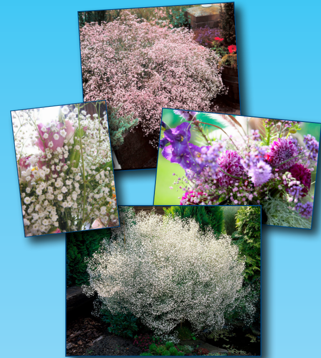
Baby's Breath ( Gypsophila paniculata hybrids)