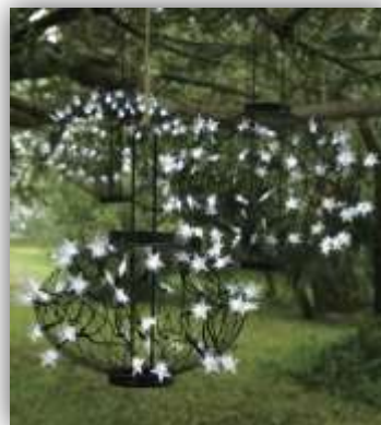
Add instant light to your yard