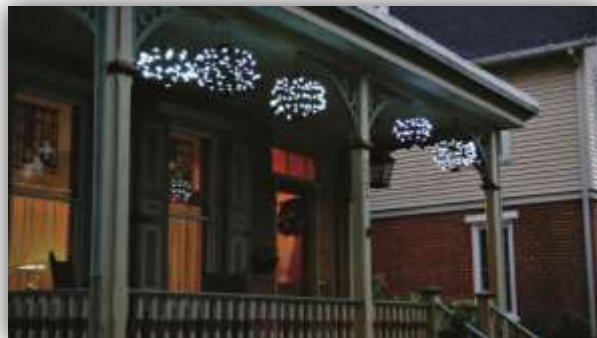
Decorate your porch