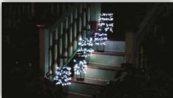
Light up your stairs at night