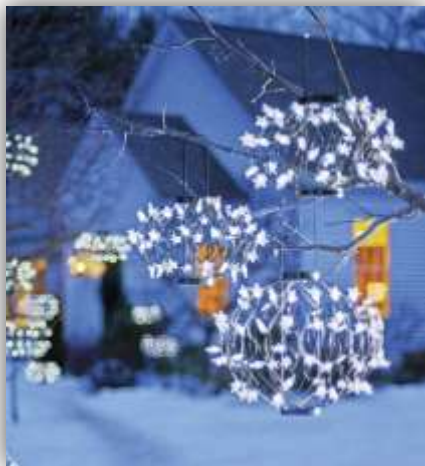
Festive in the snow

Your new Solar Star Lantern is as versatile as it is beautiful. Besides its numerous uses in and around your home, it can be displayed in varies shapes. It can be left as a column of star lights, lowered into a circular ball, or an elliptical. Mix and match shapes for visual variety